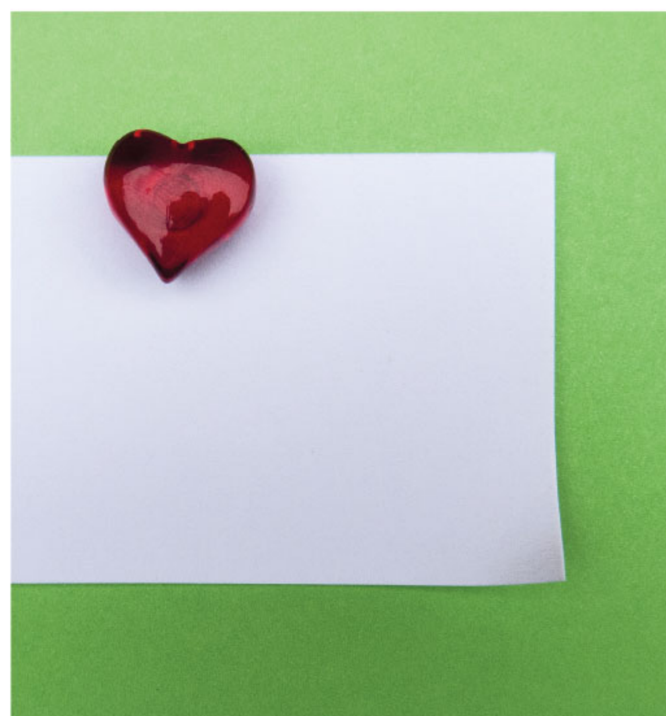
Paint it any color.

Got something on your mind? Then write it on your walls. With Scribil Dry-Erase Coating from Vitrulan, you can turn your walls into an idea board. Scribil goes on easily with a roller – just like regular paint. And its clear finish eliminates the limitations of traditional whiteboards, allowing any color to show through on your wall. For superior style and function, Scribil can go on over any surface including Vitrulan wallcoverings and Vitrulan Cinch Magnetic Wallcovering . The result is a professional-grade, dry-erase surface that's simple to write on and erase.