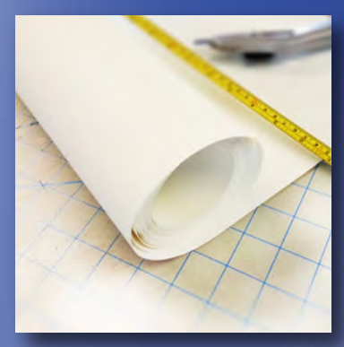
Overlay is easy to apply and corrects imperfections